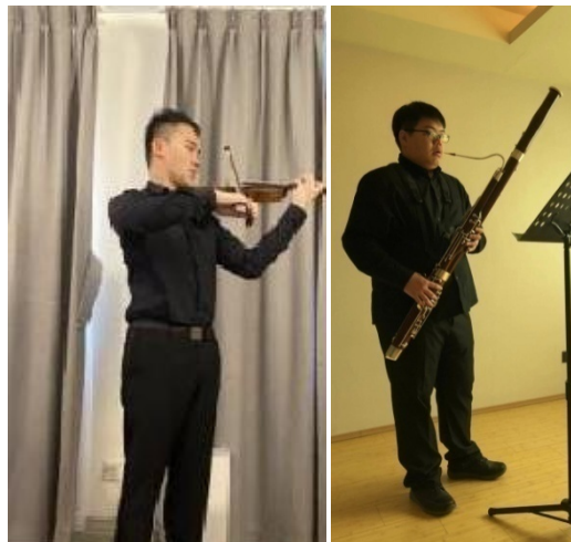
Stringed Instrument Performance Wind Instrument Performance